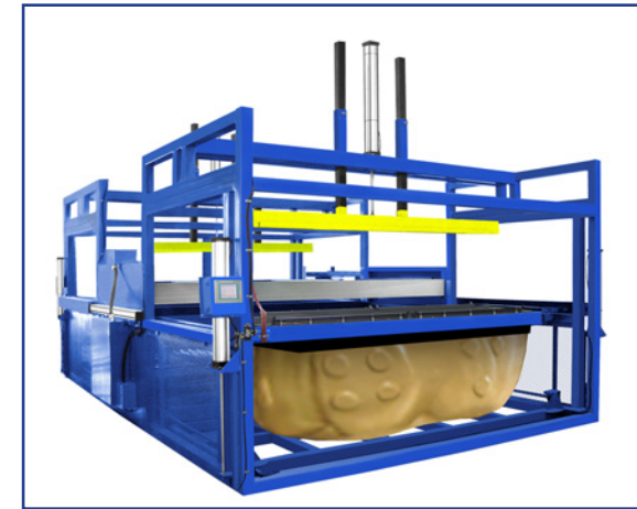
Option: Double-Ender Spa-Machine