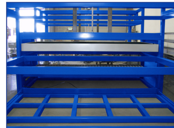
Upper and Lower Forming Tables