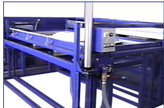
Option: Tooling Travel 32" Dual Cylinder Spur and Rack Guided