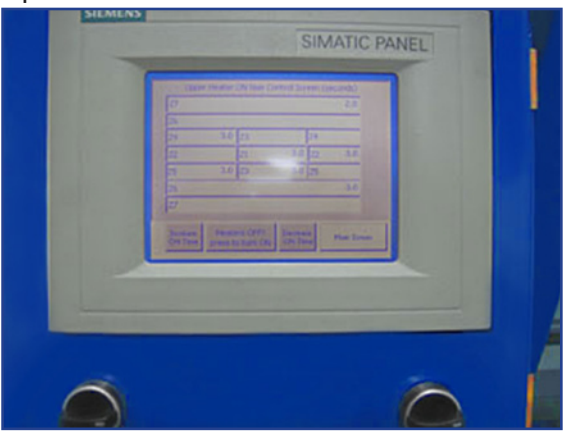
Option: PLC Heat Multi-zone Control