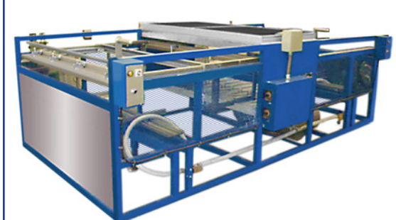
Model BV E-Class 53" x 33" or 53" x 53" Double-Ended Shuttle Vacuum Former