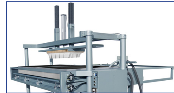
Option: Vacuum Former with Overhead Assist