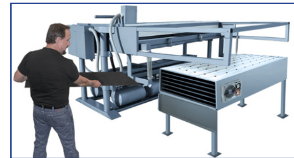
Available Option: Air circulated dry- ing oven; Recommended for pre-drying Polycarbonate, Raydel and the pre- heating of heavy gauges plastic.